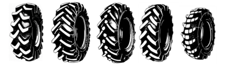
The types of tires at issue are similar to the examples pictured above, and are thus classified in subheading 4011.69, HTSUS, as "Other, having a herringbone or similar tread: Other."

CBP has concluded in prior rulings that "herring-bone" refers to a tread pattern consisting of rows of short slanted parallel lines going in the opposite directions from the center of the tread with the slant alternating row by row. These short slanted rows would meet in the center of the tire tread to form a "V" shape. See HQ 958100, dated March 25, 1997. This is supported by the Explanatory Notes (EN) heading 40.11, in which tires classified in subheadings 4011.61-4011.69 (having a herringbone or similar tread) are pictured. All the tire treads pictured therein, except for one, have rows of short slanted parallel lines going in opposite directions with the slant alternating row by row, which stop in the center of the tire and form a "V"-like pattern. The remaining tread pictured in the EN has short slanted parallel lines with the slant alternating row by row which do not meet in the center, but instead extend below the opposite slanted line. This is not a standard herring-bone tread, but an example of a "similar" tread. The tread lugs may be one solid line from sidewall to center, individual raised ridges aligned in a herringbone pattern, or a combination of a strip of tread and ridges forming the angled line. Examples of herringbone and similar treads are pictured below: