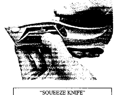
"SQUEEZE KNIFE" with Blade Extended and Activator Lever Depressed