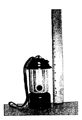
The Companion<sup>TM</sup> Lantern in a closed position.

Pictures of the Companion<sup>TM</sup> Lantern are shown below. For ease of reference, the item was placed next to a standard 12-inch ruler.